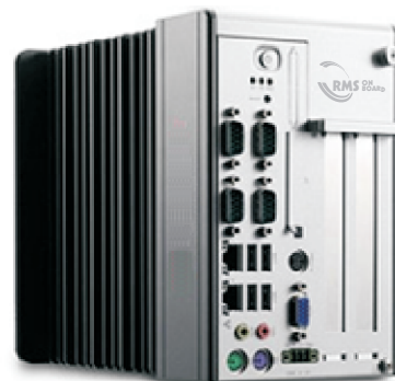
RMS On Board

The recordings are totally multistream, MJPEG, MPEG4 and H.264 both video and audio, with alarm management and system monitoring, making RMS On Board the best option in any IP video installation.